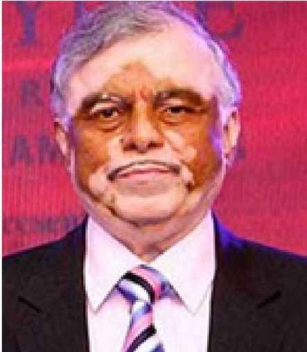
Shri. Justice P. Sathasivam The Hon'ble Governor of Kerala and Chancellor